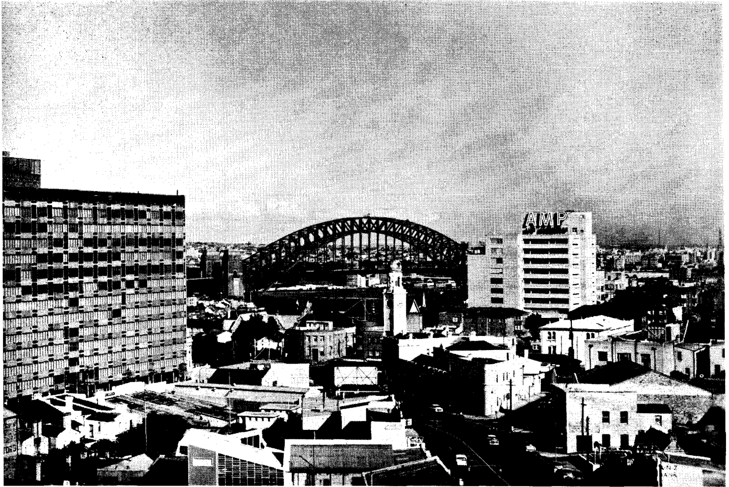
The ultra-modern "MLC" building, left, with famous old Sydney bridge in the background. Directly across the street from the building in which our new offices are located, and in the right center of the picture, is the small branch bank. Facing it, though not visible, is the North Sydney Post Office. The Radio Church of God offices in the "MLC" building look out over the sweeping expanse of beautiful Sydney Bay, and are located on the opposite side of the building.

ily after family. Eating was a delight this day for with each bite came a fellowship long to be remembered. Love and unity was strong and each enjoyed one another's conversation and presence. Seated on the grass, everyone was able to relax and just fellowship one with another and learn more about the bond between those jointly striving to enter into the kingdom of God.